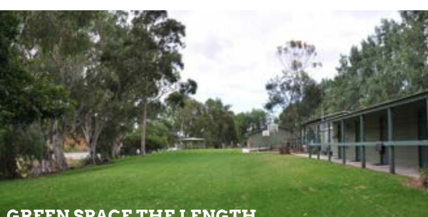
GREEN SPACE THE LENGTH OF THE CAMPSITE