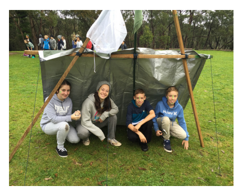
Camping & Bush Skills Outdoor Education

Groups complete a series of Bush Skills sessions including Knots, Emergency Shelters & Cooking