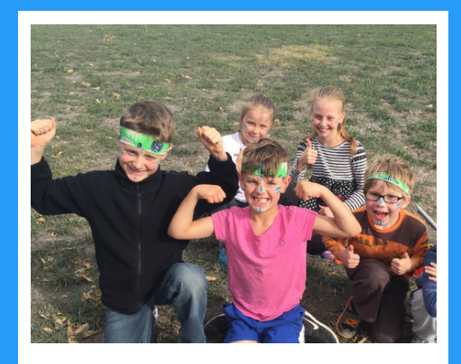
Team FUNN Reception - Year 3

FUNN activities and games which teach basic team skills & concepts.