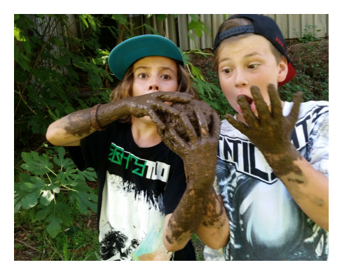
Get Out & Play In Nature

Groups complete a series of Bush Skills sessions including Knots, Emergency Shelters & Cooking